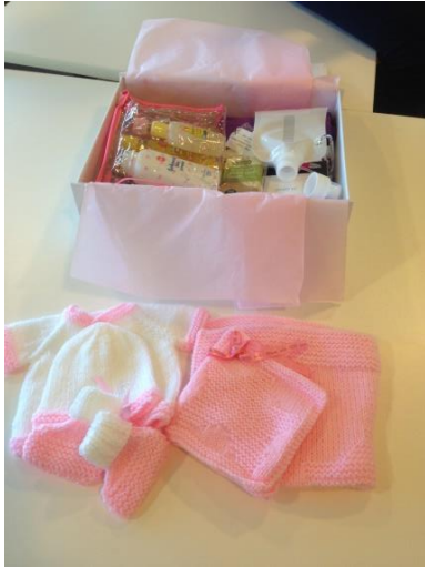
Emily's Gift Neonatal Box

Emily's Gift Neonatal Boxes and mini packs are made for both boys and girls in appropriate sizes for 3lb, 4lb and 5lb weights. Included in each box and mini pack is a blanket, 2 bonding squares, a hat and a jacket / cardigan, all of which have been kindly knitted and then donated by an army of volunteers.